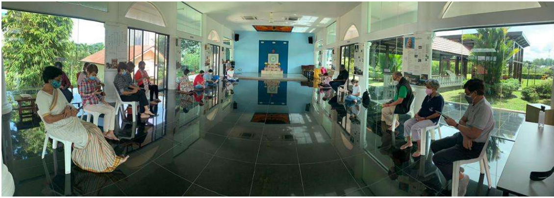
The group in deep reflection at the Temple of the Universal Spirit